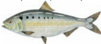
Shad ( Alosa sapidissima )

No minimum size Using only hook and line, a person may fish for or possess