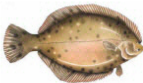
Winter Flounder ( Pleuronectes americanus )

Click on fish for more information about that species